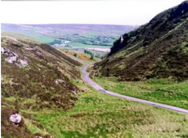
View looking north into Butterlope Glen [H 493 947], 3.5 km NNE of Plumbridge, Co. Tyrone. (P947961)