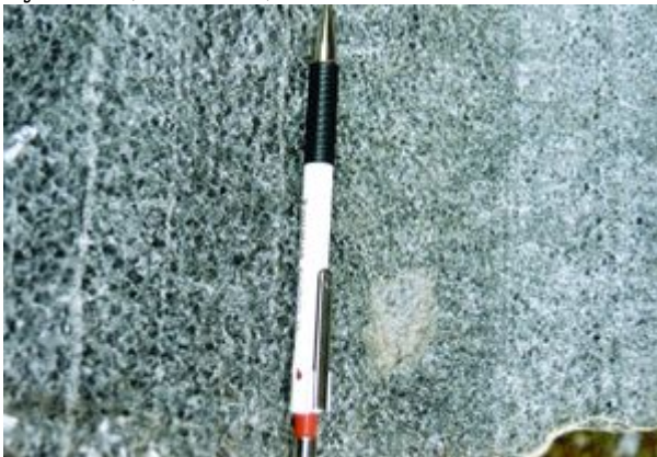
Black calcite in recrystallised limestone of the Dungiven Limestone Formation. Disused quarry on west bank of Owenrigh River [C 669 048], Banagher Glen, 5 km SSW of Dungiven, Co. Londonderry. (Pen 15cm long). (P947962)

The oldest Dalradian rocks in the Sperrin Mountains belong to the Newtownstewart Formation and are exposed in the core of the recumbent Sperrin Fold ( P947793 ) and ( P948093 ). They consist of pale grey, thickly bedded, quartzose psammite with thin pelite interbeds which outcrop between Ballynamallaght and Newtownstewart, with some of the best exposures in quarries at Letterbrat [H 471 923], 2 km northwest of Plumbridge, and Cashty Wood [H 371 814] in the Baronscourt Estate.