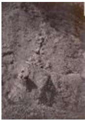
Phonolite dyke in Nepheline basalt. Topkowitz