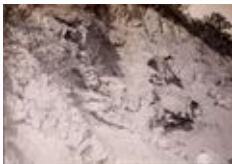
Gabbro dykes in Turonian marl Katzenstein