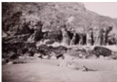
Caves in Carb Lst Conglomerate Pendine