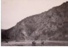
Rock on Vltava from boat (downstream)