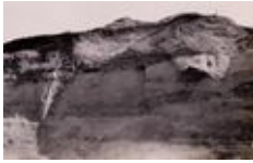
Cliffs between Herne Bay & Reculver. London Clay on Oldhaven Beds