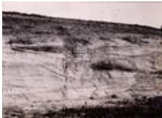
Current Bedded Folkestone Sands. Pit near Sandhurst Farm, Kennington (Padgham's Pit)