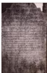
• Tombstone in Winchester Cathedral grounds (23.10.6 in the photos)