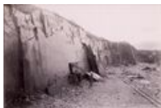
• Helwith Bridge Quarry, Horton Flags