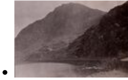
Tryfan and Llyn Ogwen from Ogwen Cottage