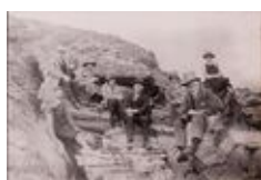
• Party on cliffs at Borth y Gest. 20.6.5.