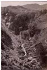
Tilberthwaite Gill and Stream, lower part