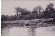
Chalk. Thanet Sand, with party & Terrace gravel above, near Stone