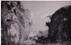
Wolf Cave Opening due to weathering out of dyke