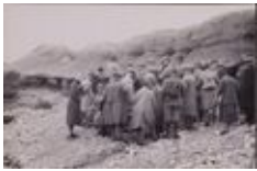
Party at raised beach, Cave Hole 15.5.32