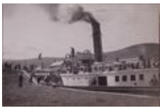
“Gondolier” in lock Fort Augustus