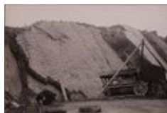
Pressure ripples in ? Car.Lst. Hawkshead Rd.