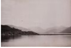
Near Kentallen. Ballachulish slate quarry & entrance to Glen Coe