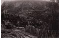
Columnar Basalt Doseley Quarry