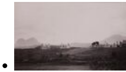
Suilven & Canisp from Knockan