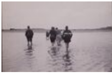
Crossing Cockle Bight, Scolt Head Island