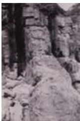
Cinder bed, Purbeck, Vertical end on Durdle