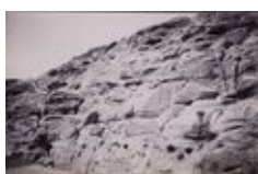
Ashdown sand. Castle Hill, Hastings