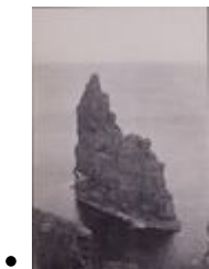
Stacks of John o' Groats sandstone. Duncansby Head