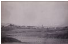
Pay de Parion & Petit Pay de Dome from La Baraque