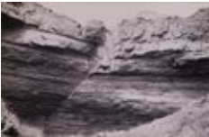
Dry waterfall, Shepherds Chine