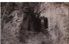
Cave & Pillar lower mottled, Eardington