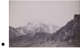
Snowdon - west face