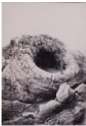
Tree trunk Purbeck E of Lulworth Cove