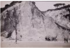
Bagshots with junction with Bracklesham grey (Whitecliff Bay)