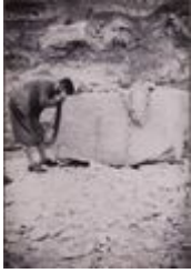
Block of Portland limestone nr. Easton with C. C. Wang