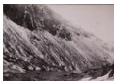
Dow Craggs & Goats Water