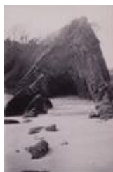
Anticline. Coal Meas. Saundersfoot