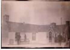
Post Office John o' Groats