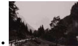
Looking up valley towards Gr Scheidigg (no screen)]