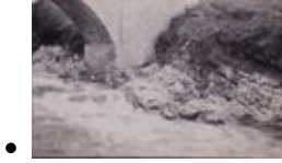
Rodded structure in Moine Schist Oykel Bridge