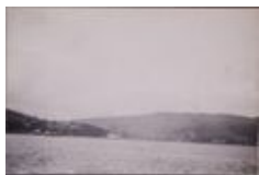
Lamlash and Goat Fell range behind