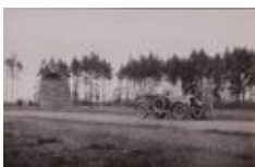
Culloden Moor Battlefield. Cairn with Smith & Car