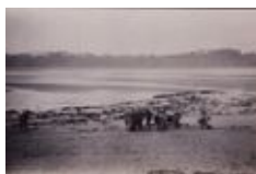
River Severn at Purton with party