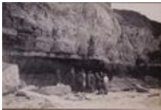
Party at Hunstanton Cliffs