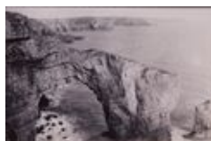
Green Bridge of Wales, Carb Lst Flintstone