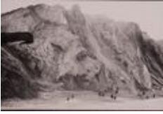
Alum Bay Cliffs to right of pic.