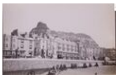
Castle rock. Hastings, from beach