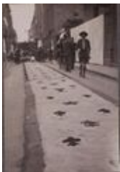
Procession of Fete-Dieu St