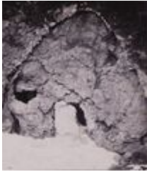
Contorted Purbeck beds, Stair Hole, Lulworth