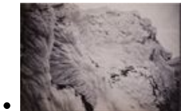
Frost needles on rocks at Snowdon summit