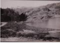
Tarn Hows & Langdale Pikes