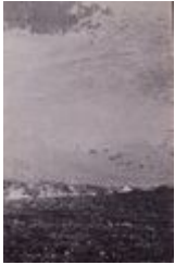
Inside Crater of Pay de Parion (snowcapped)