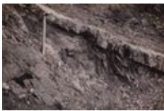
Unconformity, Long Mynd and purple shales (green at top) at high dip under Valentian. Plowden