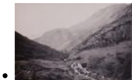
Snowdon & Stream from combe, from Watkin Track