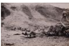
Mud glaciers. Cliffs between. Near Hamstead