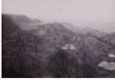
“Graves of the Kings” Landslide near Wigtwizzle