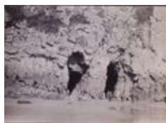
Church door arches in Carb. Lst. Skrinkle Haven