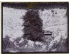
Scarp Drift overlying Upper Greensand.