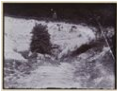
Scarp Drift overlying Upper Greensand.