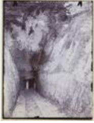
• Scarp Drift overlying Greensand near Quarry Farm.