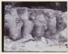
• Open working of Upper Greensand.