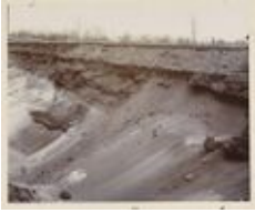
Lower Greensand capped by Gault and Boulder Clay at Shenley Hill