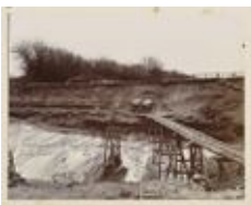
Lower Greensand capped by Gault and Boulder Clay at Shenley Hill