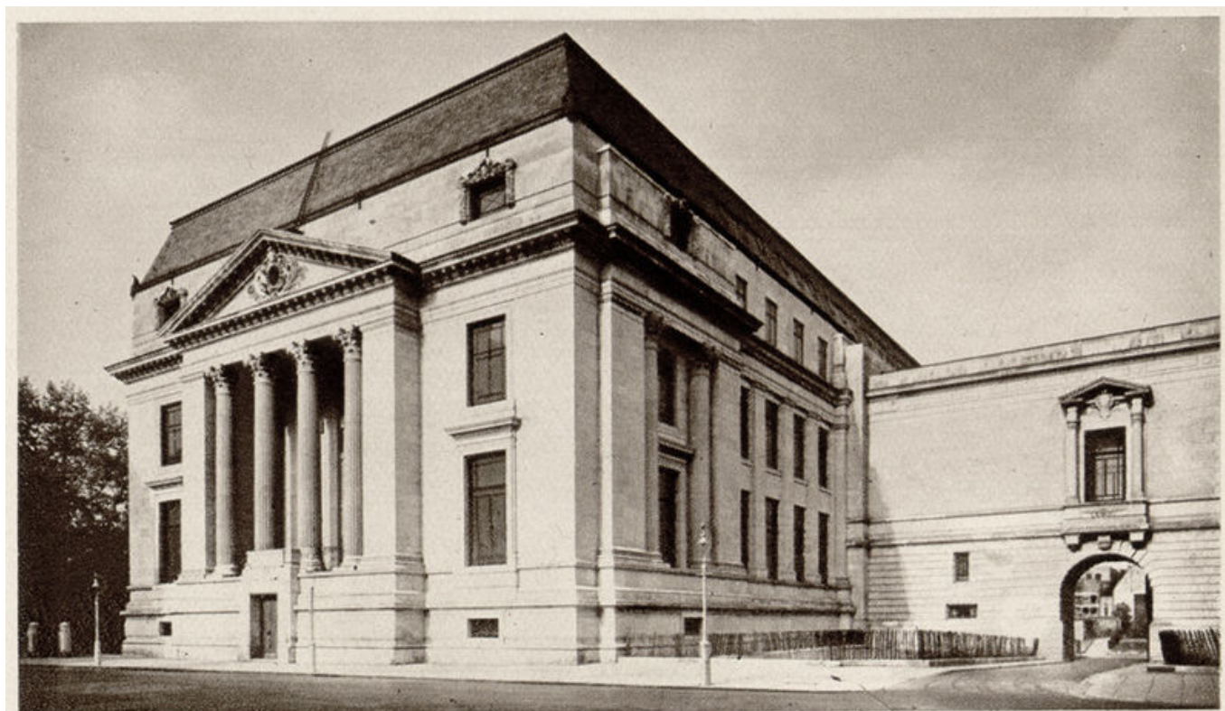
NEW MUSEUM, SOUTH KENSINGTON : Exterior View

Size of this preview: 800 × 511 pixels . Other resolutions: 320 × 204 pixels | 999 × 638 pixels .