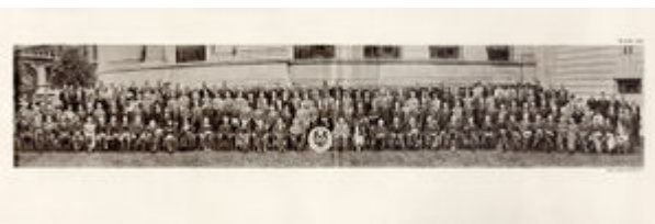
Delegates and Staff, Centenary Celebrations, 4th July, 1935 Plate XIII.

From: Flett, J.S. 1937. The History of the Geological Survey of Great Britain . London: His Majesty's Stationery Office.